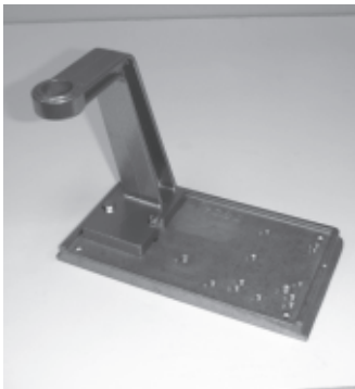
POWDER MEASURE STAND